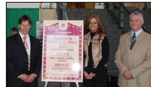
2006 Platinum Sponsors