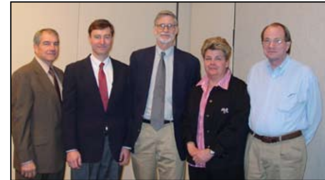
2006-2007 Board Members

Mark your calendar for the 100th Winter Meeting! It will be in Little Rock at the DoubleTree Hotel on February 9-11, 2007. It will be a celebration to remember! 100 years of meetings of your profession. That is AWESOME!