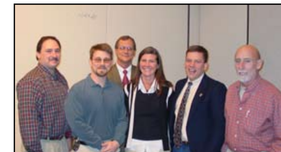
2006 - 2007 Board Trustees